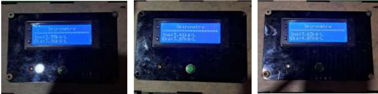
Figure 4. Functional Testing

3870 mL, and 4070 mL, with an average value of 3933.3 mL. The error for expiration capacity was 14.49%, resulting in an accuracy of 85.51%.