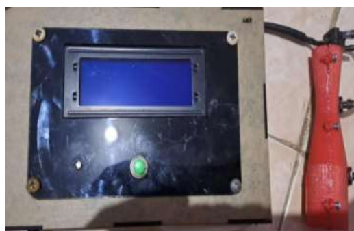
Figure 3. Portable Spirometer

The purpose of the testing is to confirm the accuracy of the device depicted in Figure 3 by performing calculations and analyzing data. This includes assessing the average value, correction factor, and accuracy percentage. The testing evaluates various aspects such as output voltage of battery, the input voltage of MPX5500DP Sensor and LCD.